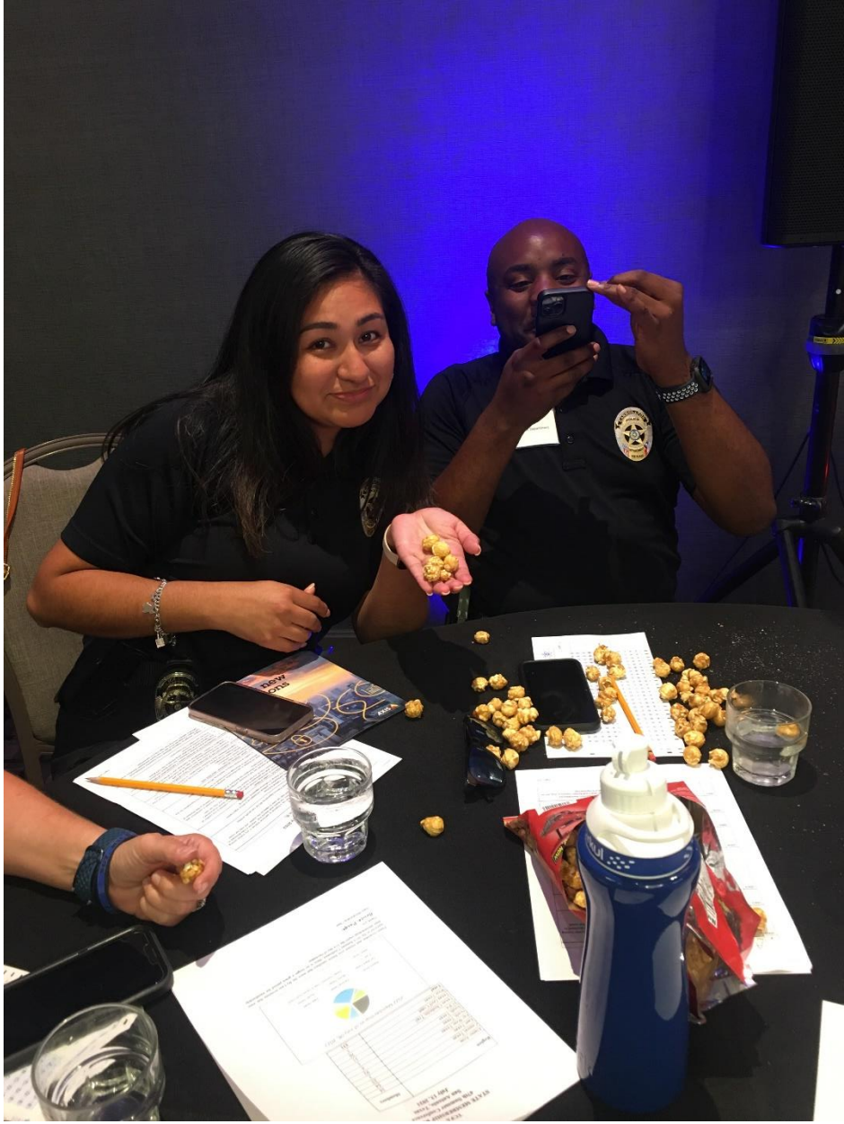
Table snacks gone wild