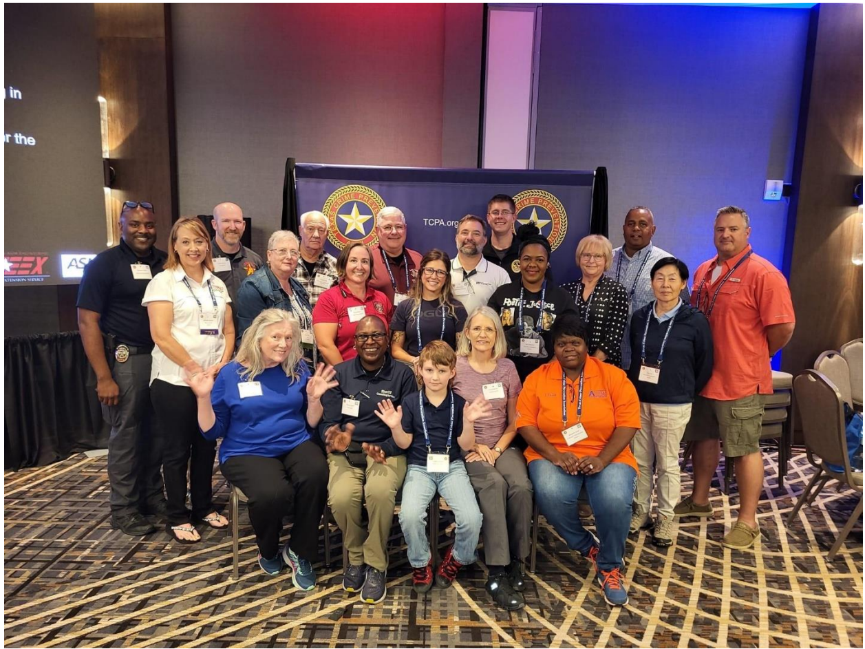
North Texas Crime Prevention Association Representatives